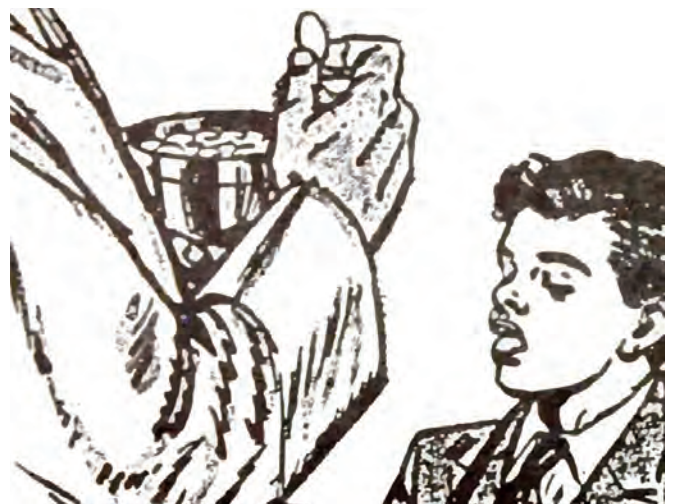
Proper posture for Communion on the tongue