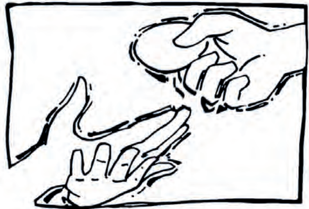
Proper hand posture for Communion in Hand